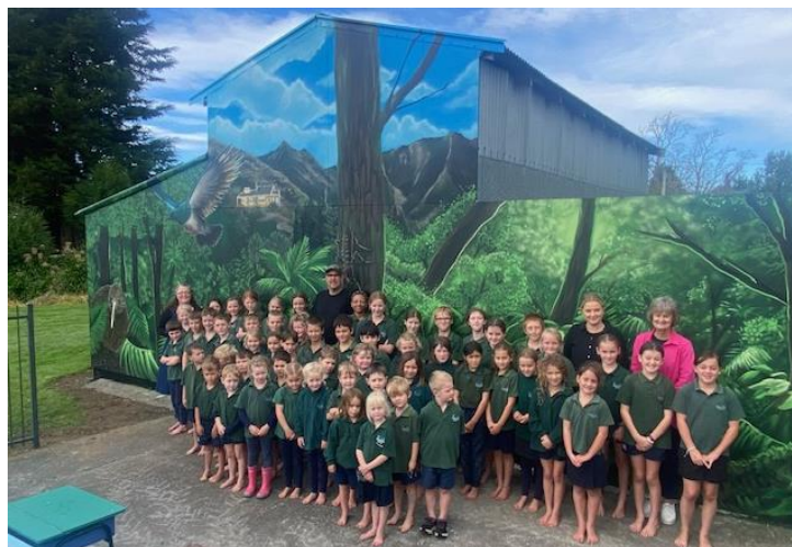
The mural looks amazing!